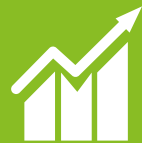
Decent work and economic growth